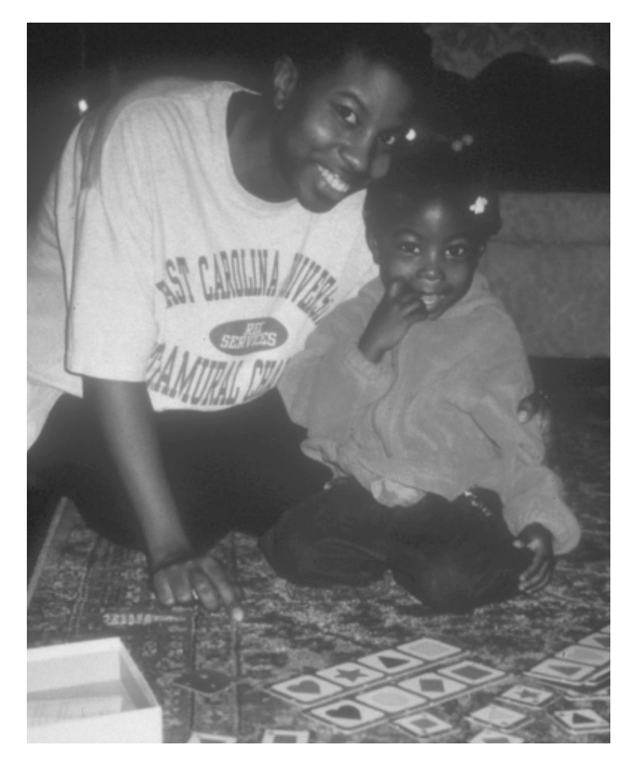
Annual Report for fiscal year 2002

MISSION STATEMENT: THE NATIONAL CENTER OF THE PARENT-CHILD HOME PROGRAM PROVIDES TRAINING AND TECHNICAL ASSISTANCE, OVERSIGHT AND QUALITY CONTROL FOR SITES REPLICATING THE PROGRAM. THE CENTER IS DEDICATED TO ADVOCACY AND OUTREACH IN ORDER TO INCREASE THE NUMBER OF PROGRAM SITES AND THE NUMBER OF CHILDREN AND FAMILIES SERVED BY EXISTING SITES.