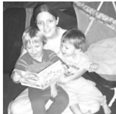
Annual Report for fiscal year 2004

MISSION STATEMENT: THE NATIONAL CENTER OF THE PARENT-CHILD HOME PROGRAM PROVIDES TRAINING AND TECHNICAL ASSISTANCE, OVERSIGHT AND QUALITY CONTROL FOR SITES REPLICATING THE PROGRAM. THE CENTER IS DEDICATED TO ADVOCACY AND OUTREACH IN ORDER TO INCREASE THE NUMBER OF PROGRAM SITES AND THE NUMBER OF CHILDREN AND FAMILIES SERVED BY EXISTING SITES.