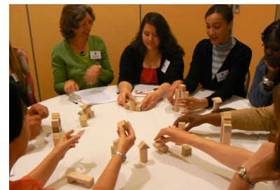
Home Visitors and Coordinators participate in a workshop at the 2009 Annual Conference