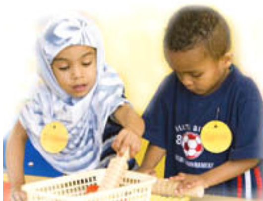
Participants in the Seattle Parent-Child Home Program practice play, a vital part of the Program model.

*Site list accurate at time of publication, please check www.parent-child.org/localsites/index.html for more information.